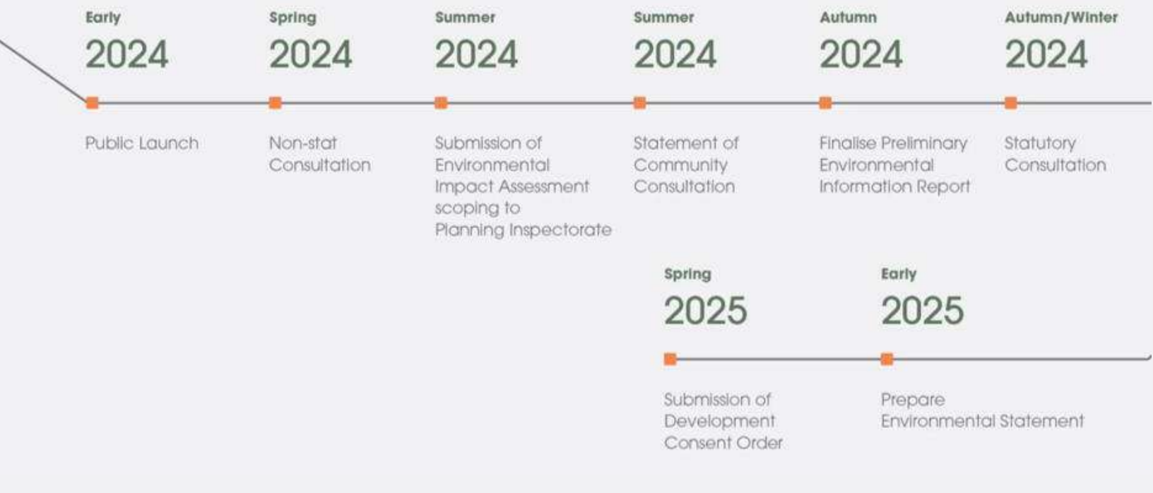
Figure 3.1 Timeline of pre-submission activity for Green Hill Solar Farm DCO application